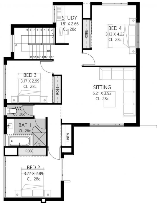
FIRST FLOOR 1:100